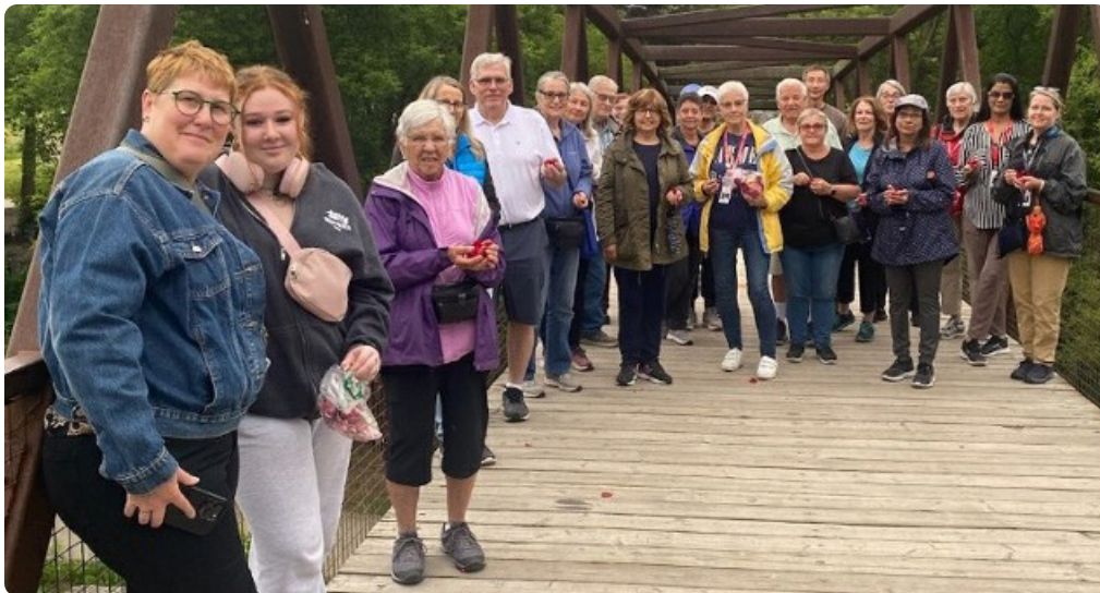
Bereavement clients from the Bereavement Social Walking Group (rose toss ceremony)